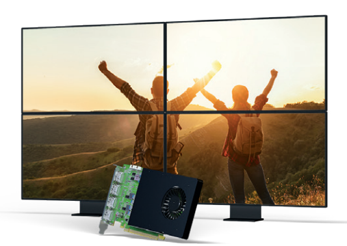
D-Series D1480 - Quad DisplayPort graphics card