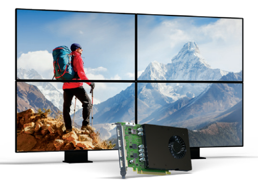
D-Series D1450 - Quad HDMI graphics card

Full-height, Gen 3 PCIe<sup>®</sup> x16 four-output graphics cards with four native HDMI<sup>®</sup> or DisplayPort<sup>™</sup> connectors deliver the best display density, resolution, and performance for demanding multi-monitor applications.