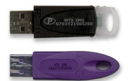
Figure 5: Computer ID and MIL run-time hardware license keys (dongles) are labeled with 'MTX IMG'. The run-time hardware license keys are available for various MIL run-time packages. To identify which package the dongle is valid for, open the MIL License Manager with the dongle connected. New (top) and old (bottom) USB dongles shown above.