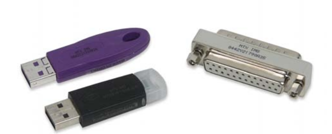
Figure 1: Hardware key (dongle) for USB (left) or the parallel port (right).

The temporary license is tamperproof. Once the license has expired it is not possible to prolong or restart the trial period by changing the system date<sup>3</sup>, or by uninstalling and reinstalling the software. Once a temporary license has expired, the only way to continue using MIL is to install a permanent development or run-time license key (Figure 3). Moreover, a MIL installation cannot be used as a MIL-Lite installation once the temporary license has expired.