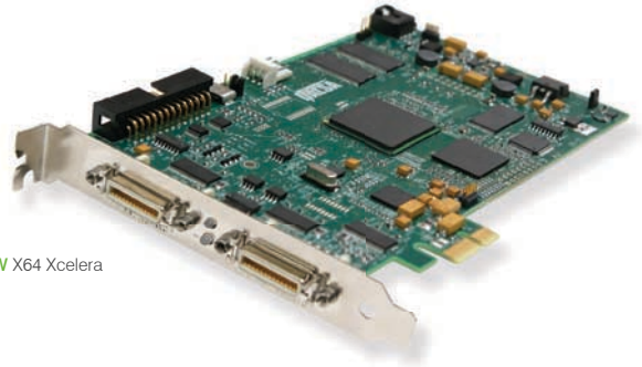
NEW X64 Xcelera

Introducing X64 Xcelera—Next Generation Acquisition/Processing Technology