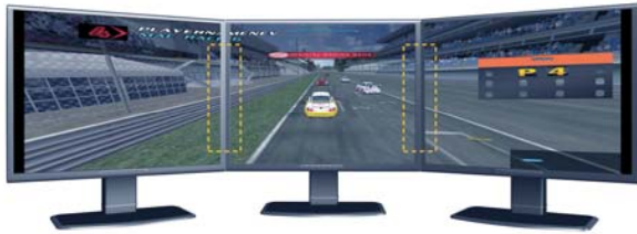
With ecransbezel (above), without (below)